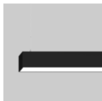
LITO 60 suspended