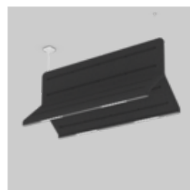
MUSE DOUBLE LIGHT acoustic suspended