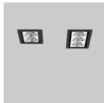
UNICO L2 / L3 recessed