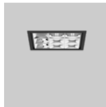
UNICO Q9 recessed