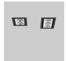
UNICO L2 / L3 basic recessed