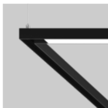
MOVE IT 25 S surface / suspended system