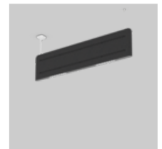
MUSE LIGHT acoustic suspended