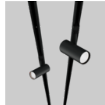
BO 55 / 70 track + group