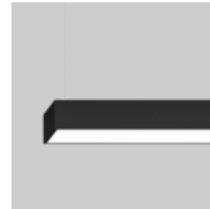
MINO 100 suspended