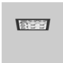
UNICO Q9 recessed