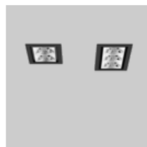
UNICO L2 / L3 basic recessed