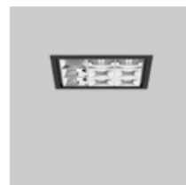
UNICO Q9 basic recessed