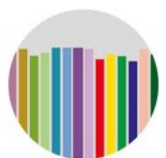
CRI ≥ 95 2 SDCM (optional)