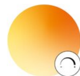
Colour Warm Dimming 1800 – 3000 K (optional)