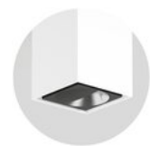
wallwasher and wallwasher floor inset