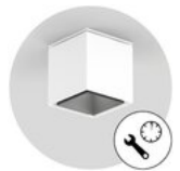
easy mounting no visible screws