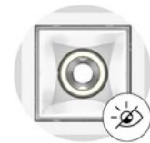
glare control (UGR ≤ 16)