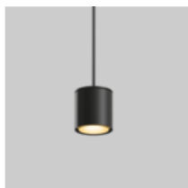
SASSO 60 round suspended