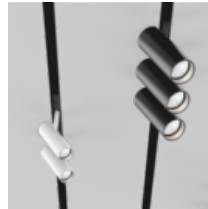
BO 32 / 45 / 55 / 70 intrack 1 | 2 | 3 lamps