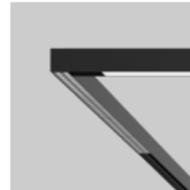
MOVE IT PRO 45 surface / suspended system