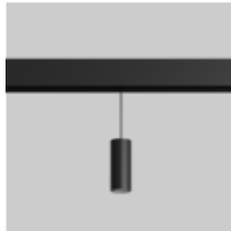
ARY suspended MOVE IT PRO 45