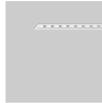
BASO 40 trim