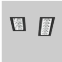
UNICO L4 / L6 recessed