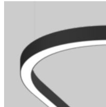
MINO 60 CURVE ceiling / suspended system