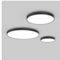
VELA surface / ceiling