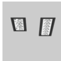
UNICO L4 / L6 basic recessed