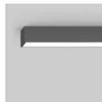
BASO 60 IP54 surface