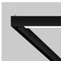
MOVE IT 25 surface / suspended system