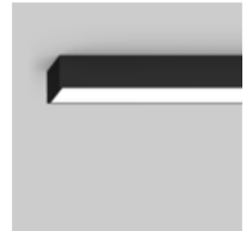
MINO 100 surface