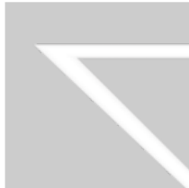
MINIMAL 100 trimless system