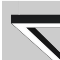
MINO 100 ceiling / suspended system