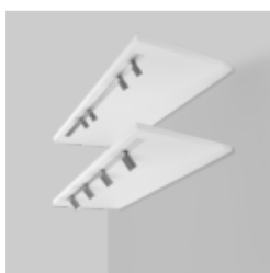
NANO just 16 / 26 / 32