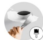
trimless installation in plasterboard

DE Quadratisches Strahlerelement aus Aluminium; pulverbeschichtet; werkzeuglose Montage im Montageset (randlos oder mit umlaufendem Rand) durch Kugelschnappsystem; spezielles Montagewerkzeug zur einfachen Installation des randlosen Gehäuses als Zubehör erhältlich; Strahlerelement werkzeuglos höhenverstellbar: deckenbündig, 25 mm oder 35 mm herausragend; COB (Chip on Board) Technologie für höchste Effizienz; keine Mehrfachschattenbildung; energieeffiziente LEDs mit sehr guter Farbwiedergabe; hochwertiger, aluminiumbedampfter Reflektor mit Facettenoptik; präzise Abstrahlcharakteristik; gute Entblendung durch zurückversetzte Lichtpunktebene; optische Aufsätze als Zubehör