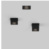
MOVE IN 45 square recessed