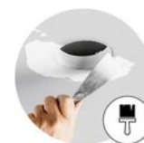
trimless installation in plasterboard

DE Quadratisches Strahlerelement aus Aluminium; pulverbeschichtet; werkzeuglose Montage im Montageset (randlos oder mit umlaufendem Rand) durch Kugelschnappsystem; spezielles Montagewerkzeug zur einfachen Installation des randlosen Gehäuses als Zubehör erhältlich; Strahlerelement werkzeuglos höhenverstellbar: deckenbündig, 25 mm oder 35 mm herausragend; COB (Chip on Board) Technologie für höchste Effizienz; keine Mehrfachschattenbildung; energieeffiziente LEDs mit sehr guter Farbwiedergabe; hochwertiger, aluminiumbedampfter Reflektor mit Facettenoptik; präzise Abstrahlcharakteristik; gute Entblendung durch zurückversetzte Lichtpunktebene; optische Aufsätze als Zubehör