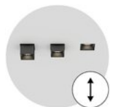
tool-free height adjustment