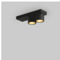
SASSO 60 base 2 lamps ceiling