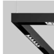
MOVE IT 45 surface / suspended system