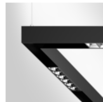
MOVE IT 45 suspended indirect system