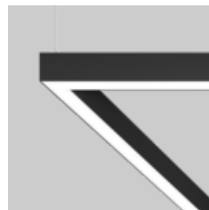
MINO 60 ceiling / suspended system