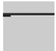
OPAL HIGH PERFORMANCE MOVE IT 25 S