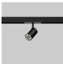
JUST 45 MOVE IT 25 / 25 S / 45