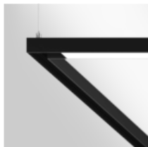
MOVE IT 25 S suspended indirect system