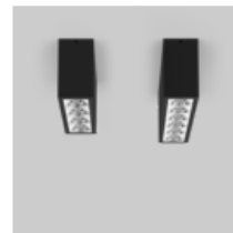
UNICO L4 / L6 basic ceiling