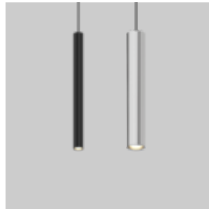
TULA MOVE IT 25 / 25 S / 45