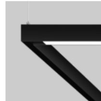
MOVE IT 25 surface / suspended system