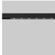
SPOTLINE MOVE IT 25