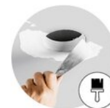
trimless installation in plasterboard

DE Quadratisches Strahlerelement aus Aluminium; pulverbeschichtet; werkzeuglose Montage im Montageset (randlos oder mit umlaufendem Rand) durch Kugelschnappsystem; spezielles Montagewerkzeug zur einfachen Installation des randlosen Gehäuses als Zubehör erhältlich; Strahlerelement werkzeuglos höhenverstellbar: deckenbündig, 25 mm oder 35 mm herausragend; COB (Chip on Board) Technologie für höchste Effizienz; keine Mehrfachschattenbildung; energieeffiziente LEDs mit sehr guter Farbwiedergabe; hochwertiger, aluminiumbedampfter Reflektor mit Facettenoptik; präzise Abstrahlcharakteristik; gute Entblendung durch zurückversetzte Lichtpunktebene; optische Aufsätze als Zubehör